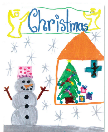
Artwork by a student of the DePaul Children's

Thank you again to our committed donors and volunteers who make this event possible.